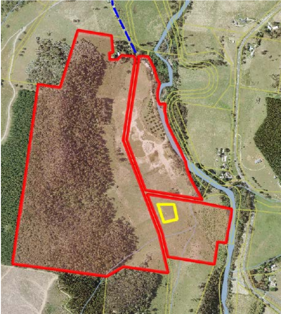
Figure 2: Subject land and Excavation Area.