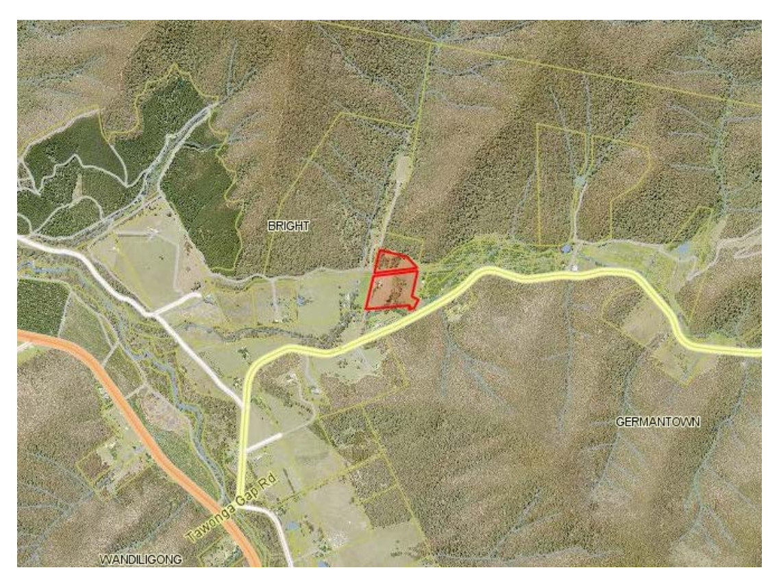
Figure 4: Subject land and surrounding context