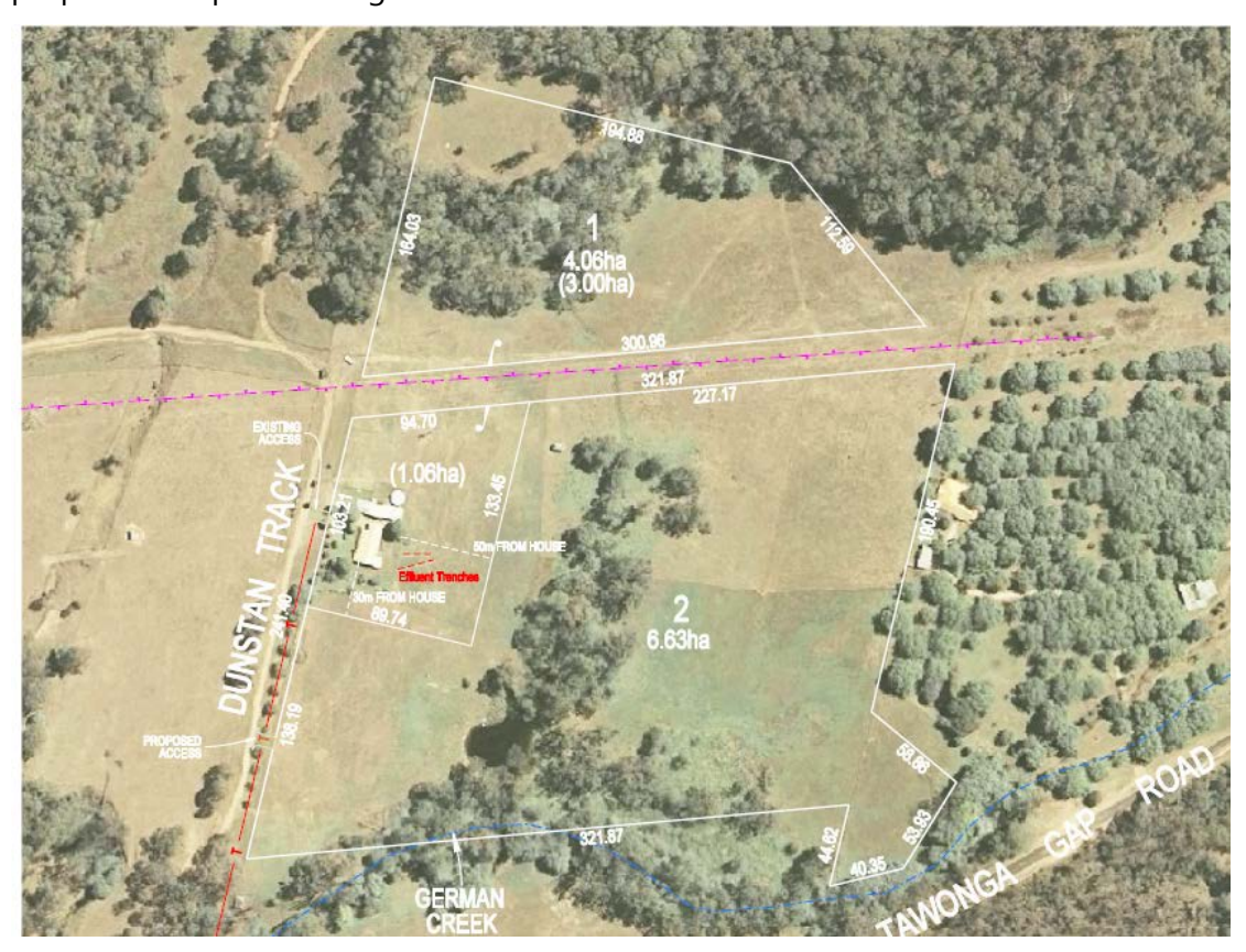
Figure 1: Proposed re-subdivision

It is proposed to re-subdivide five existing lots to create two lots. Proposed Lot 1 would have an area of 4.06 hectares and would be separated into two parcels via an unmade government road. It would contain the existing dwelling. Proposed Lot 2 would be 6.63 hectares and would consolidate the remainder of the site. The proposal is depicted in Figure 1 below.