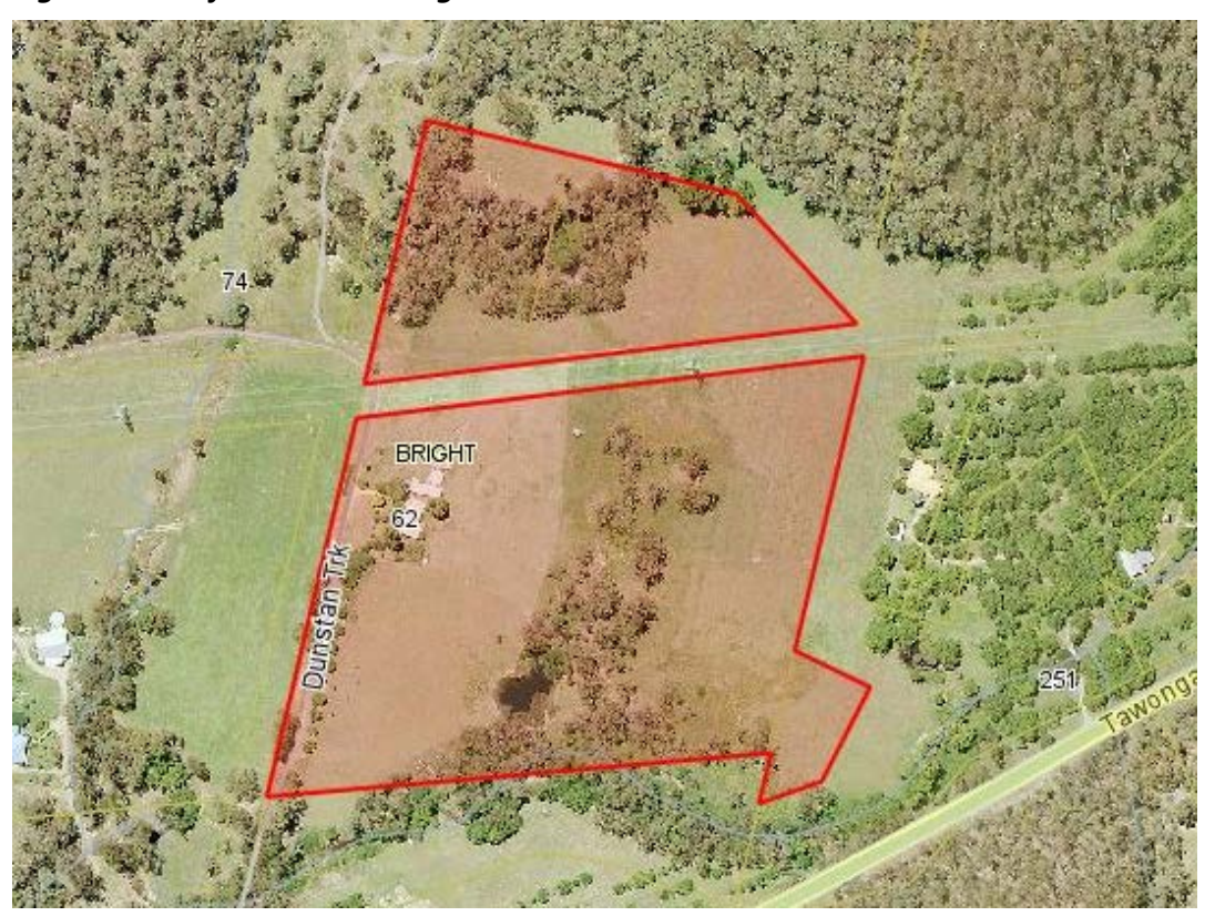
Figure 3: Subject land