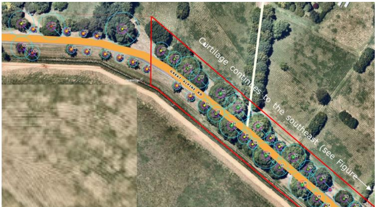
Figure 3: Recommended curtilage (western section) for the Heritage Overlay outlined in red.

The recommended curtilage for the Heritage Overlay includes the 48 trees and surrounding land that accommodates an appropriate setting for this heritage place and tree protection zones is outlined in Figures 3 and 4.