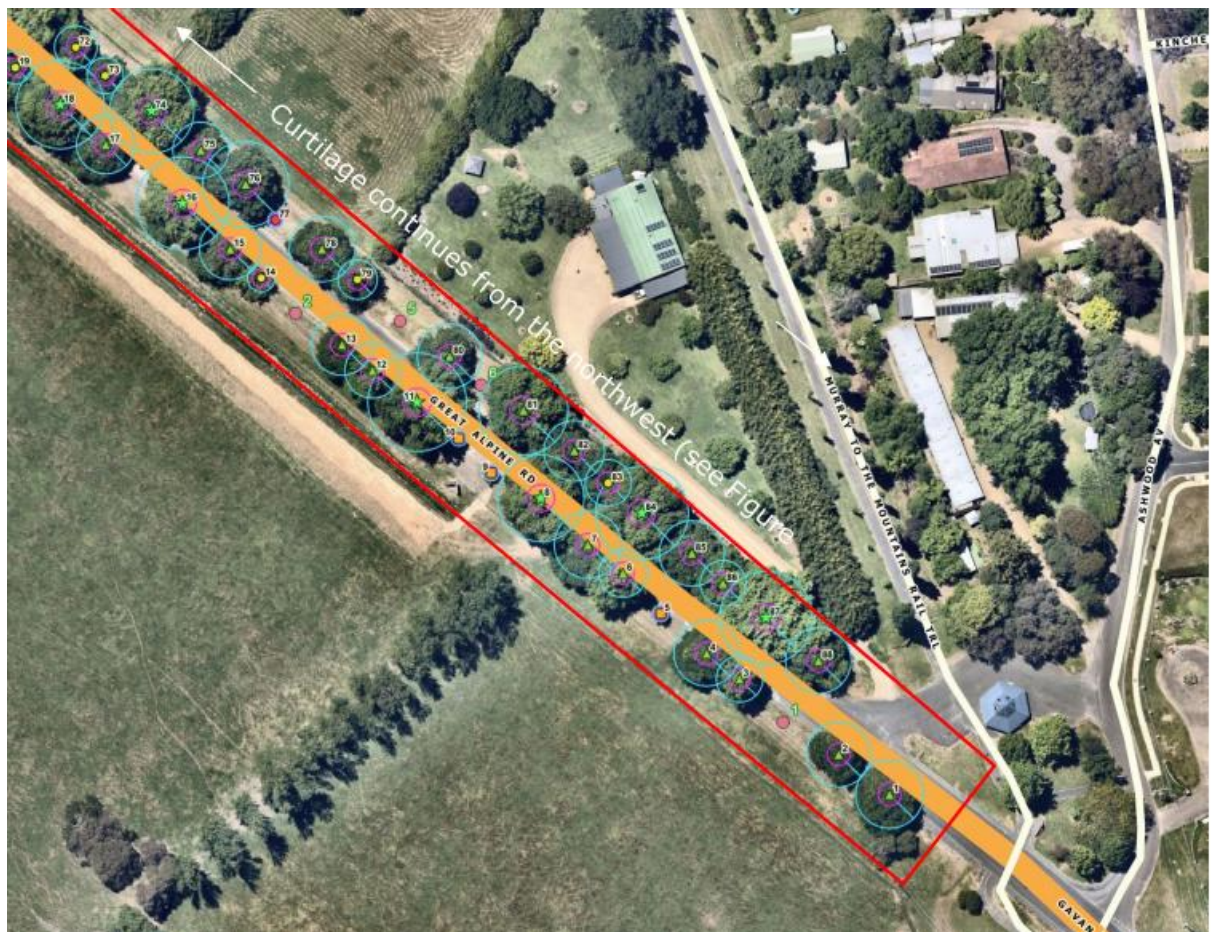
Figure 4: Recommended curtilage (eastern section) for the Heritage Overlay outlined in red.

Other sections of the avenue are less intact or are more recent plantings that have reasonable to low integrity and therefore are not considered to meet the threshold of local heritage significance.