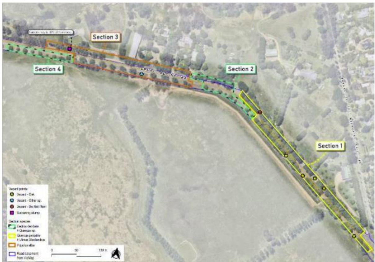
Figure 1: Annotated map of the avenue of tree divided into four sections of species.

The preliminary assessment suggested that Section 1 of the avenue has the potential to meet the threshold of local heritage significance, noting that this section is highly intact forming a picturesque and distinctive entry feature into the township, and was