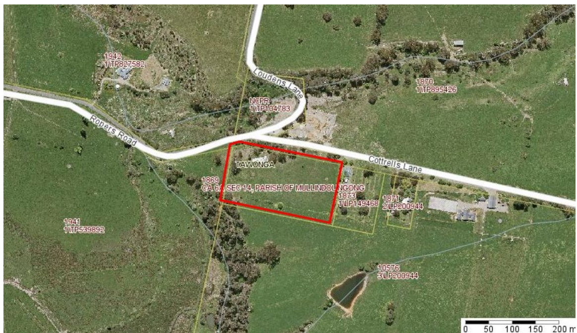
Figure 2: Subject land.

There are four (4) large (over 40 hectares) open farmland sites, within close proximity (500 metres) of the site, of which two (2) directly abut the subject site, and three (3) smaller sites within close proximity (500 metres) of the site, of which two (2) have a dwelling.