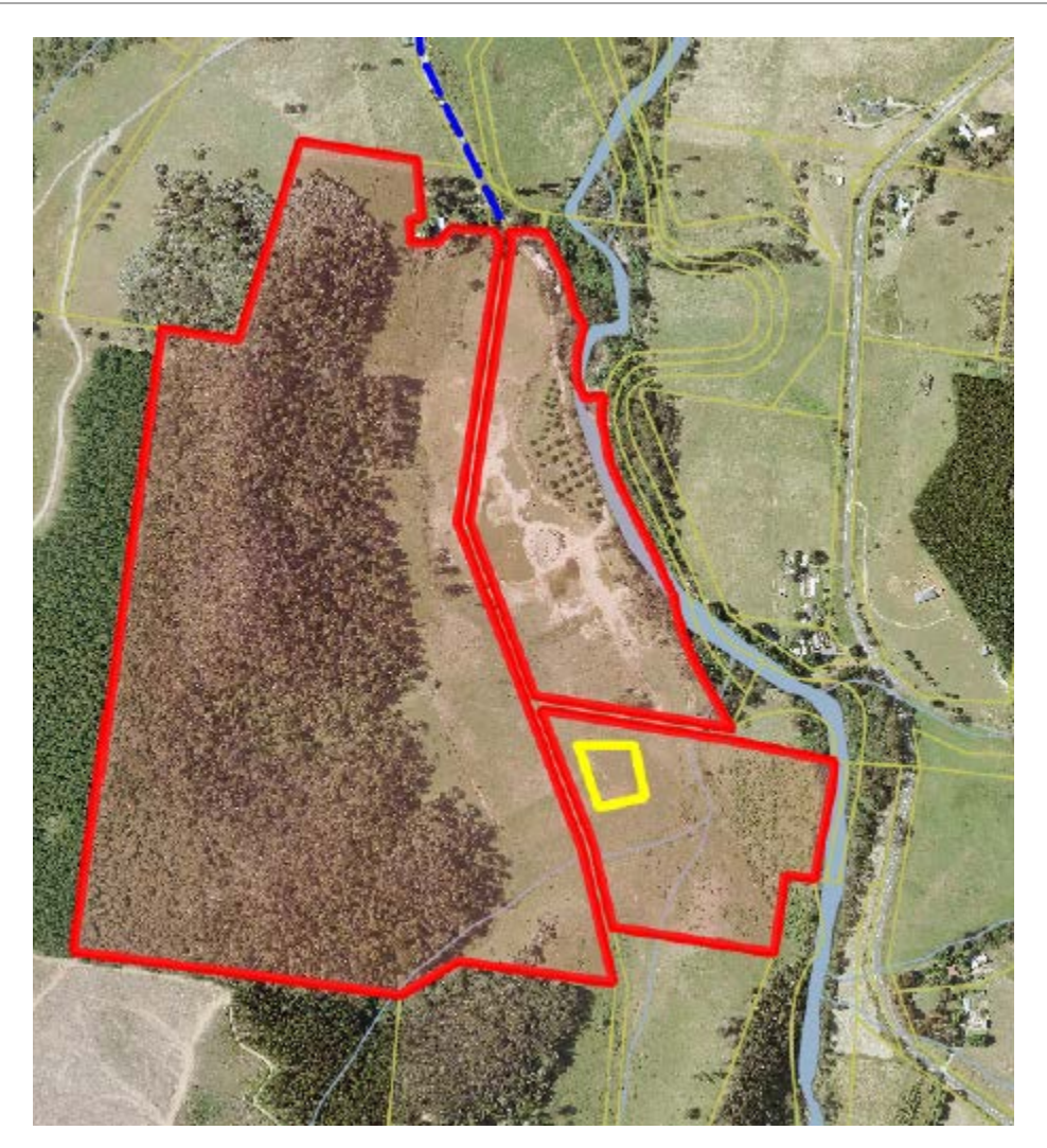
Figure 2: Subject land and Excavation Area.