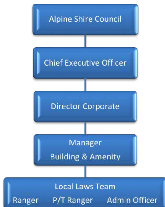
Figure 2 – Operation structure of local laws

Local Laws has an annual expenditure budget of approximately $47,000 and employs the equivalent of 1.4 full time people. Line management for local laws service delivery is provided by the following structure: