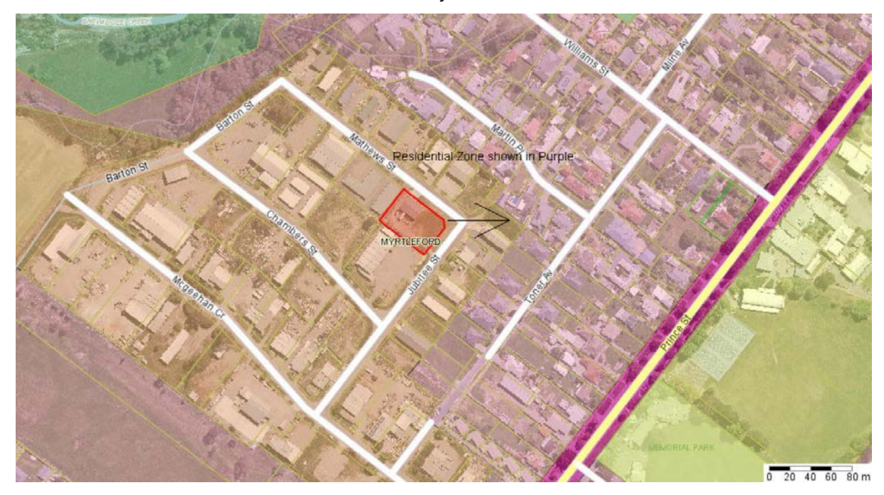
Figure 2: Subject land.

The subject site is located within the Industrial Estate of Myrtleford. The site is located in the North-Eastern pocket of the estate locating it some 50-60m away from the nearest residential housing to the East and South-East. The site is located on a corner and has dual access from Jubilee Street and Mathews Street. The site is also occupied by an existing Industrial warehouse used for the purpose of bus and vehicle storage. Figure 2 below shows the context of the site, and demonstrates the proximity of the land in relation to the residential areas close by.