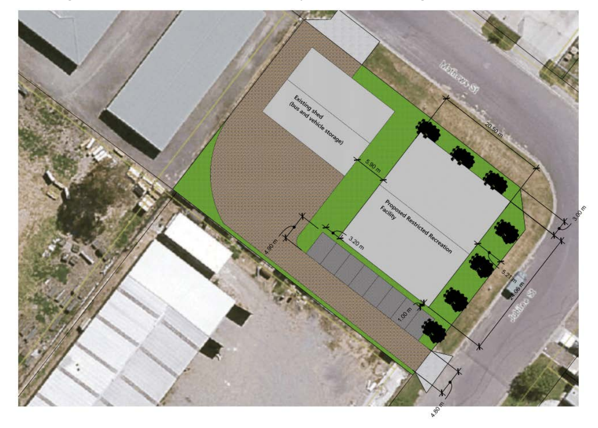
Figure 1: Shows the development layout on site.

The images below show the proposed site layout of the building: