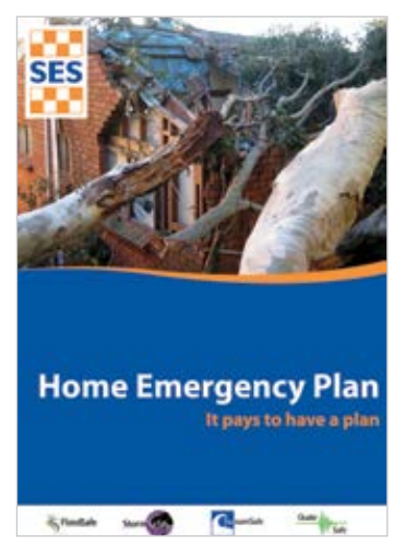
Visit ses.vic.gov.au to obtain a copy of your Home Emergency Plan workbook